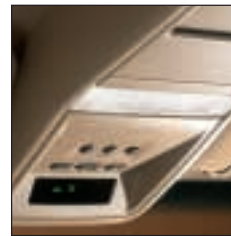
The new overhead console includes individual map lights, a compass, valet clip and sunglass storage.