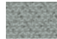
Light Flint Cloth