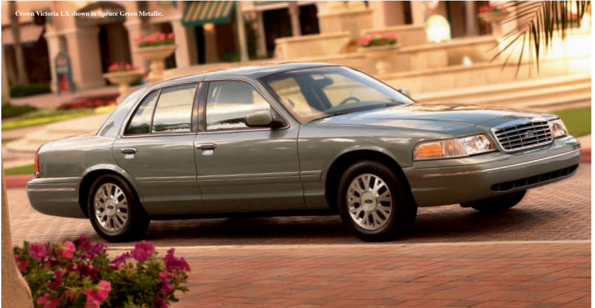
Crown Victoria LX shown in Spruce Green Metallic.

Today, it's rare to find "V8," "full-size" and "agile" in the same sentence, much less in the same luxurious car.