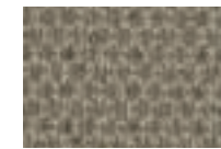
Medium Parchment Cloth