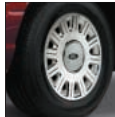
16" Deluxe Locking Wheelcovers Standard on Crown Victoria