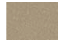
Medium Parchment Leather