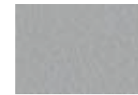
Light Flint Leather