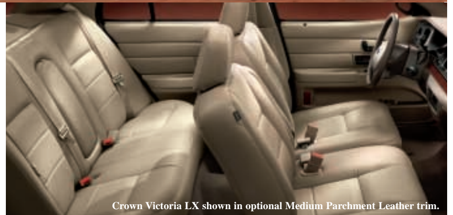
Crown Victoria LX shown in optional Medium Parchment Leather trim.

Consider for a moment the rear-wheel-drive Crown Victoria's proven V8 power. And then, think: Never one to skimp on stretch-out comfort, Crown Victoria is a most accommodating host that understands completely the importance of 6-passenger spaciousness and user-friendly nuances. And agility? The new Crown Victoria answers with new front suspension and rack-and-pinion steering systems. In fact, the new Crown Victoria's performance and control are now so impressive you might be tempted to believe it's as nimble as some smaller cars. And you'd be right.