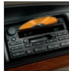
The new dual media AM/FM stereo sound system plays either a cassette or CD.