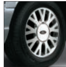
16" Alloy Wheels Standard on LX